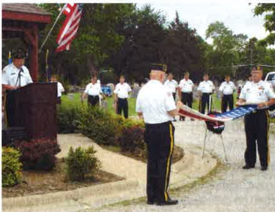
The Folding of the Flag by the American Legion Ceremonial Detail at a previous Memorial Day Ceremony.

The event is free and the community is invited to attend. White Rose Cemetery is located at 11 th Street and Virginia Avenue.